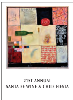
21ST ANNUAL SANTA FE WINE & CHILE FIESTA

Tickets purchased by August 31, 2011 will be mailed. Tickets ordered after August 31st may be picked up Monday, September 19th through Friday September 23rd, between 9am and 5pm, at the SFW&C Fiesta Hospitality Suite in the lobby of La Fonda Hotel.